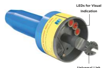
LEDs for Visual Indication Universal Link